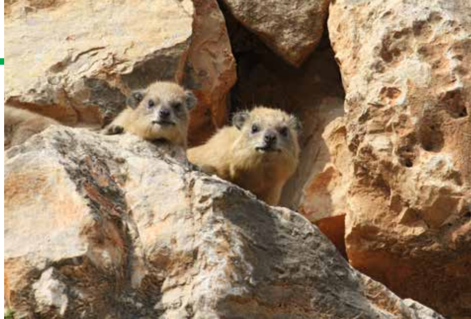
Hyrax Procavia capensis .

Through GEF/SGP support, we carried out a field survey of the reserve that documented 195 plant species belonging to 53 plant families, including olive trees, carob, hawthorn, maple, wild almonds, pine nuts, oak, suwaid, and sumac. The list included 17 species of rare plants, such as wild orchids, especially in the eastern part of the reserve near Kufr al-Deek and Deir Ghassaneh. Numerous vertebrates (mammals, birds, reptiles, and amphibians) and invertebrates (insects, spiders, snails, etc.) were observed and recorded. For example, 88 species of birds were recorded, 30 species of butterflies, and 19 species of land snails, including rare and endemic ones. Fourteen species of mammals were observed. Bats took the largest area, with five species initially recorded (now 10) and documented. A large colony (at least 400–500 individuals) of the Egyptian Fruit Bat, Rousettus aegyptiacus , was noted in a cave in the western