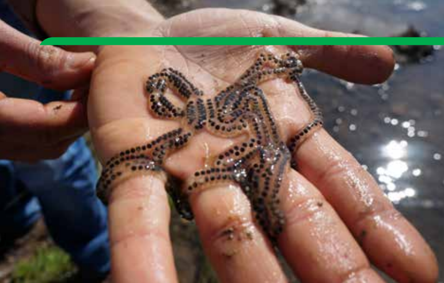
Eggs of the Levant water frog.

to protect biodiversity and preserve nature species in the wadi. In brief, these actions focus on reducing and recycling liquid and solid waste; reducing and eventually eliminating harmful human activities; developing sustainable local economies linked to environmental conservation; carrying out environmental education and awareness; enhancing enforcement of bylaws; pursuing environmental justice; managing and protecting endangered species and habitats; better rural and urban design; and studying and protecting transitional key areas.