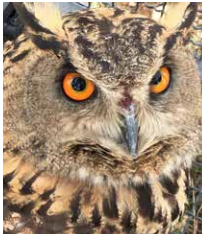
An Eagle owl rehabilitated and released in Wadi Zarqa.