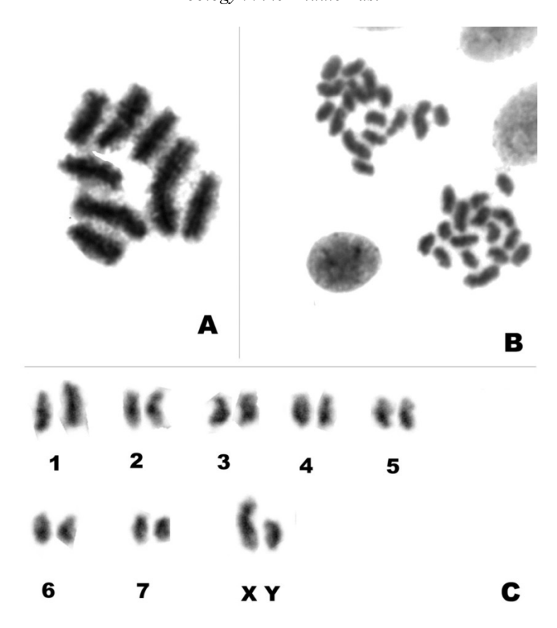
Figure 1. Cytogenetics in Hottentotta judaicus . A. Diplotene with 8 homologues. B. A slide field with two metaphases each with 2n=16. C. Metaphase karyotype.