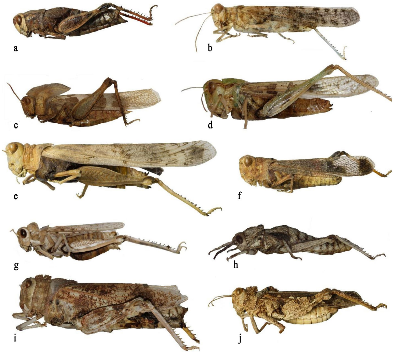
Figure 4. (a) Heteracris syriaca ; (b) Dociostaurus genei ; (c) Pyrgodera armata ; (d) Oedaleus senegalensis ; (e) Sphingonotus savignyi ; (f) Scintharista notabilis blanchardiana ; (g) Dericorys millierei ; (h) Orchamus hebraeus ; (i) Eremotmethis carinatus ; (j) Tmetthis pulchripennis asiaticus (Scale bar = 1 cm).

Dociostaurus (Stauronotulus) hauensteini (Bolívar, 1893)