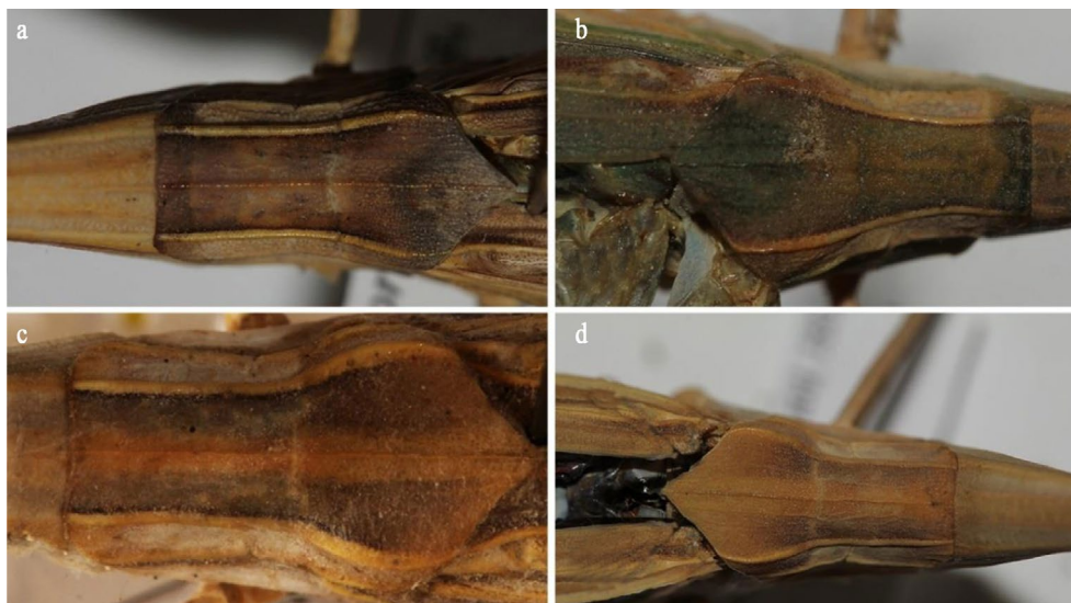
Figure 1. Pronotum of (a) Acrida bicolor ; (b) Truxalis eximia ; (c) Truxalis procera ; (d) Truxalis grandis .

southern and central coastal plains and North of the Naqab Desert (Fishelson 1985).