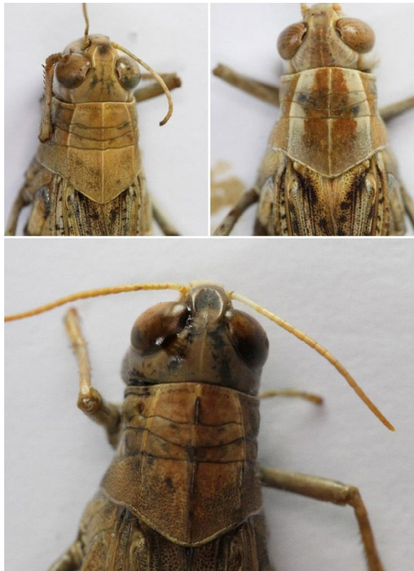
Figure 3. Variations in morphology of the pronotum of Calliptamus barbarus palaestinensis .

Notes: The Egyptian Tree Locust has a wide distribution in North Africa, Europe, central and western Asia (Fishelson 1985; Gillett 2000; Katbeh-Bader 2001). It is reported from Jerusalem (Swinton 1899), the Jordan Valley and the Dead Sea areas (Fishelson 1985). It is considered to be a serious pest in many countries.