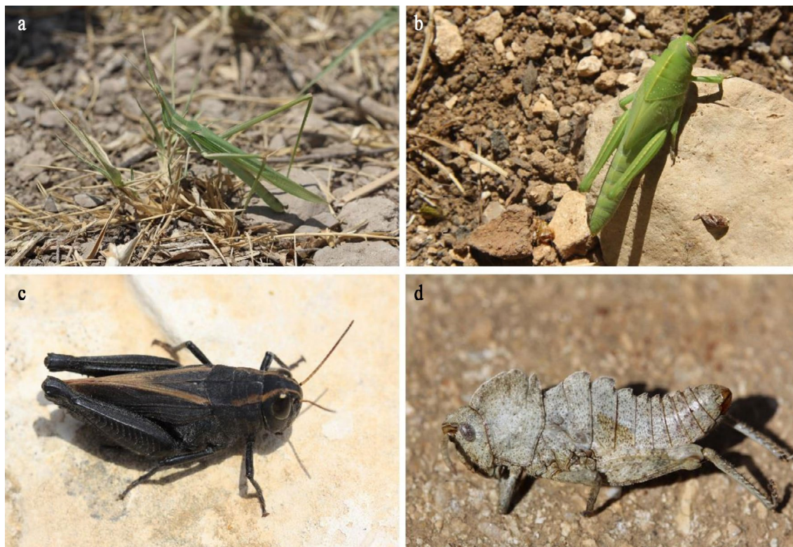
Figure 7. (a) Truxalis grandis ; (b) Anacridium aegyptium nymph.; (c) Calliptamus coelesyriensis ; (d) Prionosthenus galericulatus .

2016). Artas (PMNH4724, 12 August 2014; PMNH4726, 13 August 2014). Batir (PMNH6675, 27 May 2015). Beir Zeit (PMNH7220, 2 September 2015). Bethlehem (PMNH7907, 17 July 2016). Bettein (PMNH8036–37, 27 July 2016). Sulaiman Pools (PMNH4960, 17 August 2014; PMNH4750, 12 August 2014). Deir Jareer (PMNH8016, 27 July 2016; PMNH8018, 27 July 2016; PMNH8021, 27 July 2016; PMNH8081–82, 27 July 2016). Dura (PMNH7942–44, 22 July 2016; PMNH7981, 22 July 2016). Jenin (PMNH1805.4, 13 June 2013). Mar Saba (PMNH1953.4, 22 June 2013). Nablus (PMNH7259, 16 September 2015; PMNH7261, 16 September 2015). Nahaleen (PMNH6948, 8 June 2015). Salfit (PMNH6868, August 2014). Tal Al Asour (PMNH8044–45, 22 July 2016). Tubas-Sirees (PMNH7278–79, 17 September 2015). Wadi Al Qarin (PMNH8096–99, 29 July 2016). Wadi Al Quff (PMNH4337, 3 May 2014). Wadi Fukeen (PMNH6706, 27 May 2015; PMNH7073, 29 July 2015; PMNH4685, 9 August 2014). Wadi Al Makhrou (PMNH7190–91, 31 August 2015). Yabroud (PMNH8147, 27 July 2016).