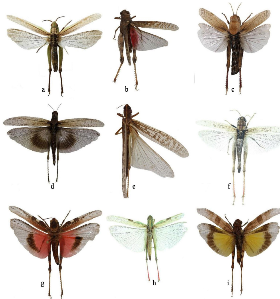
Figure 2. (a) Duriella laticornis ; (b) Calliptamus coelesyriensis ; (c) Sphodromerus serapis ; (d) Anacridium aegyptium ; (e) Schistocerca gregaria ; (f) Heteracris morbosa cincticollis ; (g) Acrotylus insubricus ; (h) Aiolopus thalassinus ; (i) Oedipoda aurea (Scale bar = 1 cm).

(PMNH7128, 10 August 2015). Nuwaima (PMNH6533–35, 24 April 2015). Wadi Al Abyad (PMNH6506–7, 24 April 2015; PMNH6515, 24 April 2015; PMNH6526, 24 April 2015; PMNH6528, 24 April 2015; PMNH6530, 24 April 2015). Wadi Al Makhrou (PMNH7192, 31 August 2015). Wadi Ta'amrah' (PMNH7328, 11 November 2015).