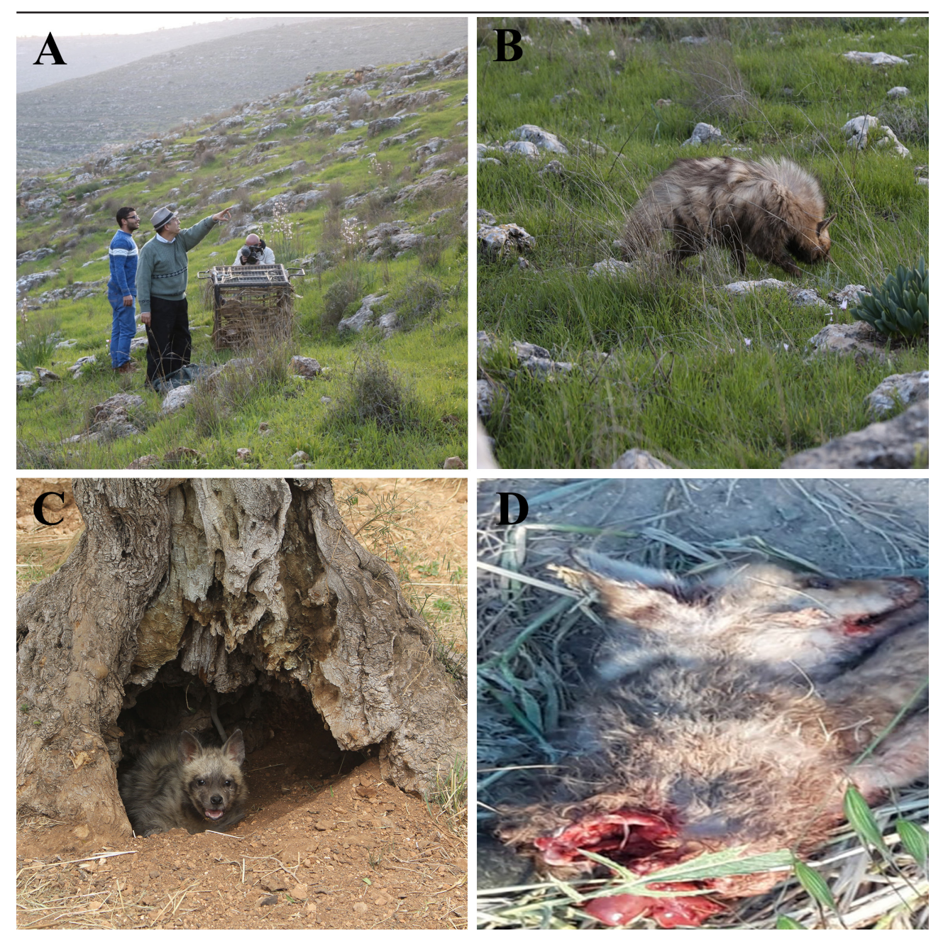
Figure 4. A - B striped Hyena released in an area to the West of Bethlehem District, C : The hyena dug under an olive tree in the enclosure during rehabilitation, D : A fox eaten by a hyena.

and environmental education and awareness in the Palestinian territories. Their efforts include animal rehabilitation and release. Their teams work with school students to create a new generation of people that respect nature to prevent and decrease infringements on wildlife. The successful story of rehabilitating and releasing a striped hyena to the wild (first of its kind in Palestine Figure 4) coupled with the pictures of the baby hyena (Figure 3) produced educational lessons. In fact, this was translated to an educational module to increase the awareness about the importance of protecting the hyena (Figure 5).