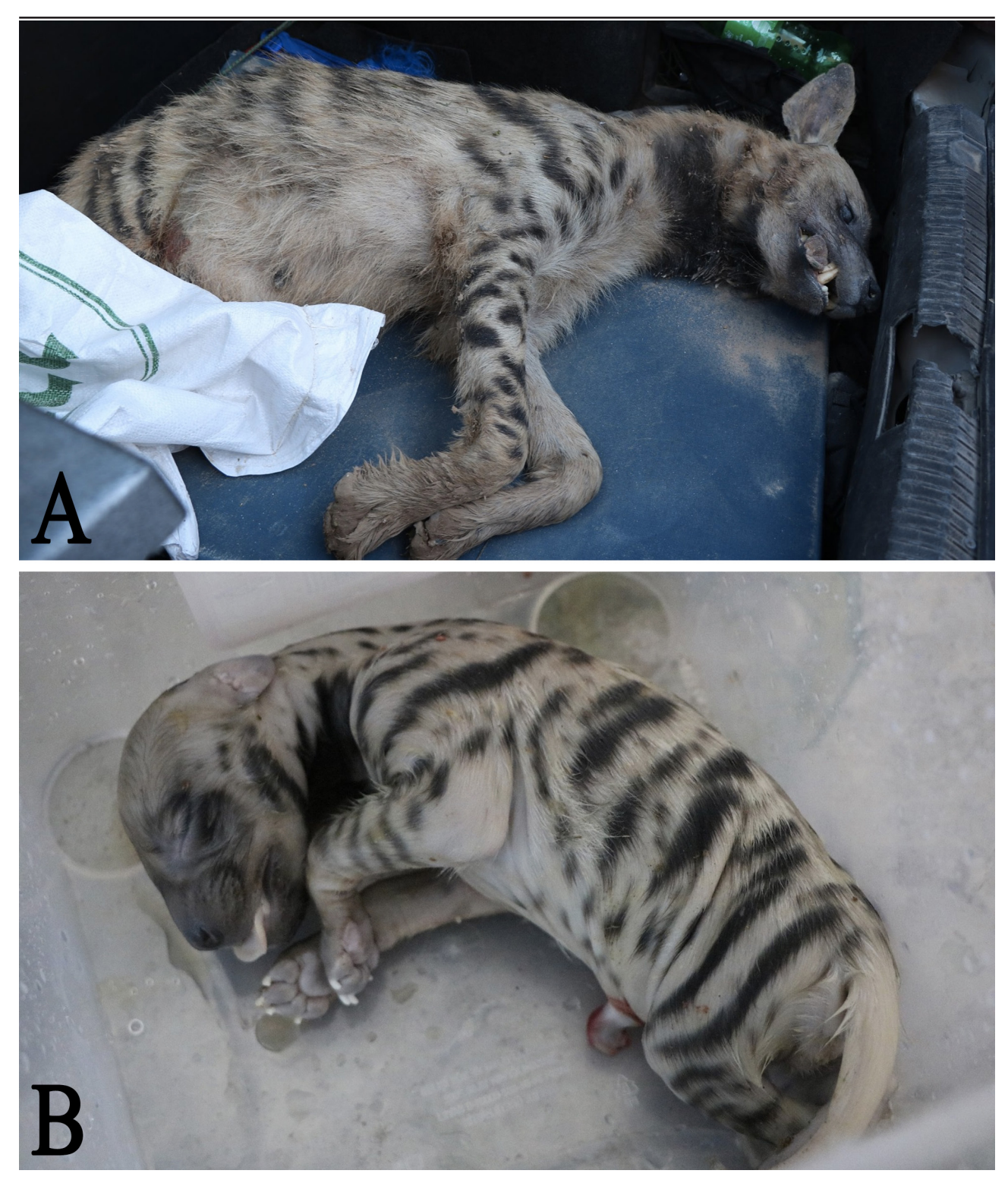
Figure 3. A: Hyena killed by a local from Al Ramadeen, B: A near-term male fetus from the dead female.

sniffing the ground and the air. On a visit week later, the researchers found tracks of the same hyena (judging by the foot print size) approximately 2 km to the west of the release site in the wooded areas near an outcropping of limestone dotted with caverns. The researchers left some food in the area one more time. This first-recorded successful release of