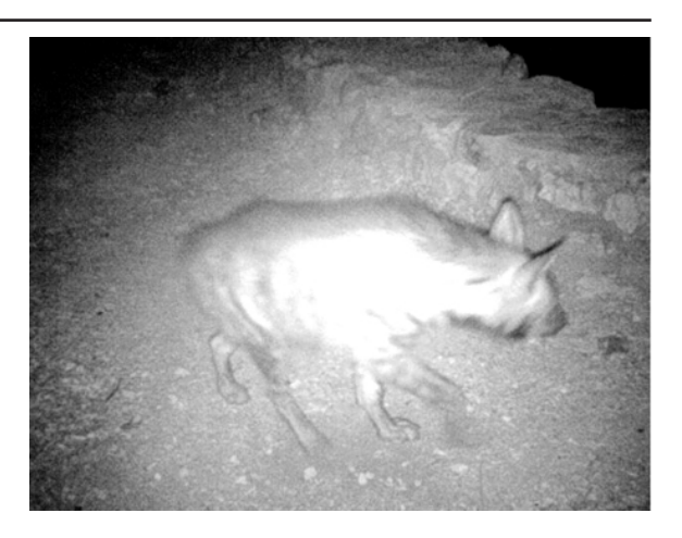
Figure 2 . The Striped Hyena from Al Makhrour Valley using a night camera trap.

On February 13, 2020, the EQA brought one female hyena that was killed by a poacher and dragged behind a car. Upon autopsy, this hyena was found pregnant with