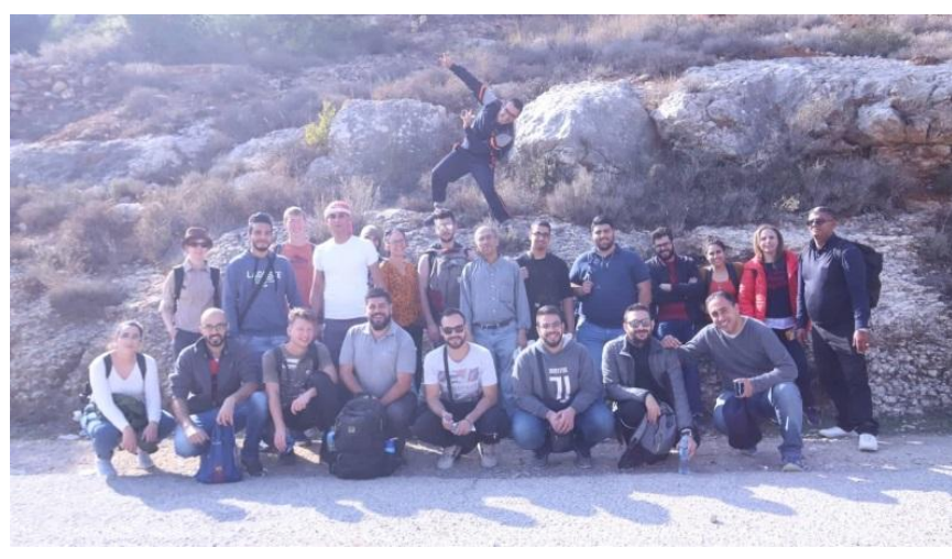
Section 2. Reports on workshop herd with students focusing on managing Al-Makhrour as a model for managing Palestinian Ecosystems