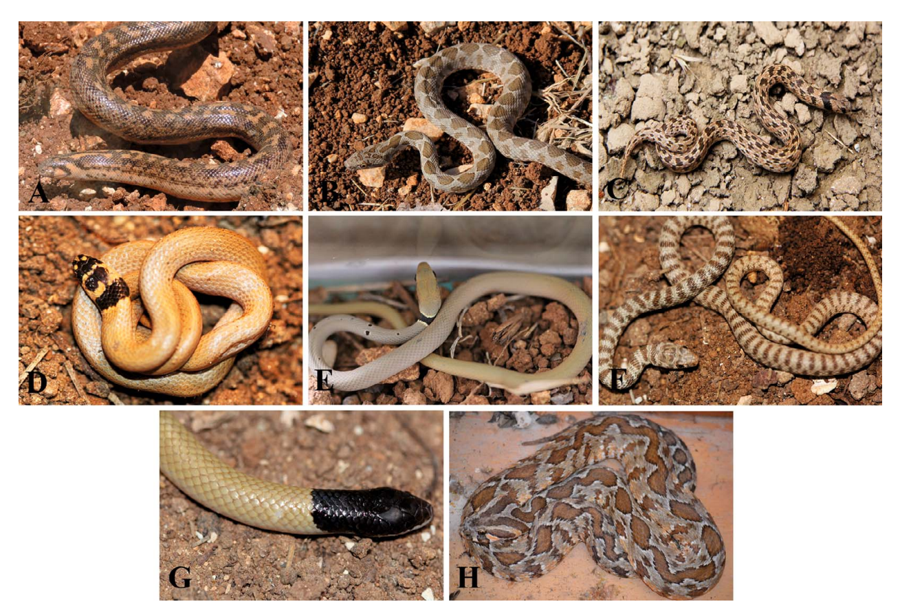
Fig. 4. A, Eryx juculus; B, Hemorrhois nummifer; C, Eirenis lineomaculata; D, Eirenis rothi; E, Platyceps collaris; F, Platyceps rhodorachis; G, Rhyncocalamus melanocephalus; H, Daboia palaestina.