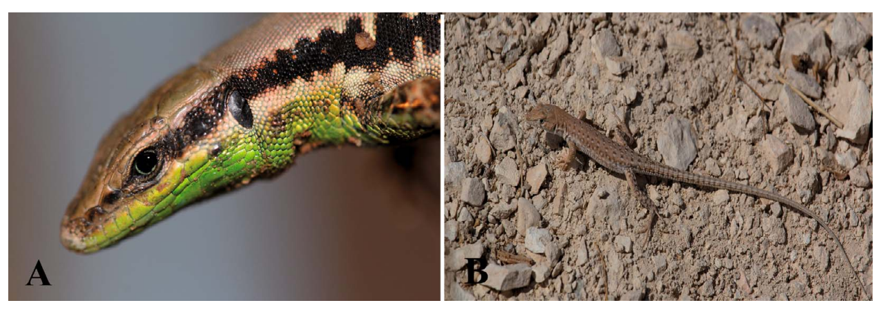
Fig. 3. A, Phoenicolacerta laevis; B, Mesalina guttulata.

um spinosum bushes and piles of stones. Flower (1933) mentioned Jerusalem as a locality for this lizard.