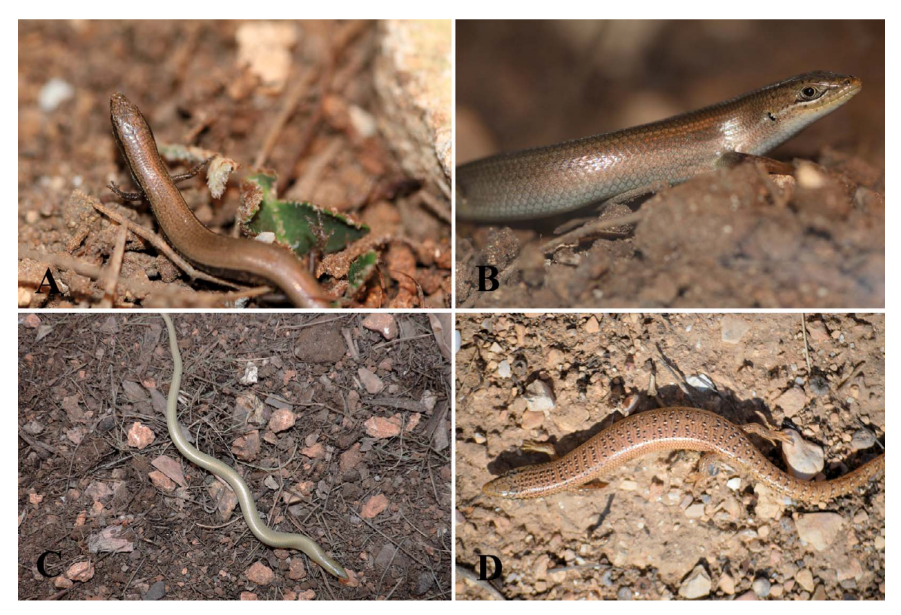
Fig. 2. A, Ablepharus rueppellii; B, Trachylepis vittata; C, Chalcides guentheri; D, Chalcides ocellatus.