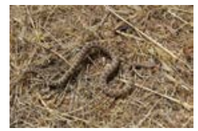
The non-poisonous Hemorrhois nummifer is the most common species of snakes in Palestine.

The findings obtained in these two case studies and many other ongoing projects support the idea that ecotourism may help communities