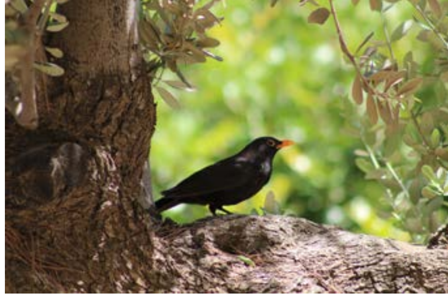
The common blackbird (Turdus merula) is native to Palestine

Asia, and Africa, in the western part of the Fertile Crescent where humans first developed agriculture. Its unique geography and geology have given Palestine more biological diversity than some countries ten times its size. The diverse habitats cover five ecozones: the central highlands, the semi-coastal region, the eastern slope, the Jordan Valley, and the coastal region. Palestine also spans four biogeographical (Mediterranean, regions Irano-Saharo-Arabian, Turanian, and Ethiopian-Sudanese subtropical). Climate is moderate with mild winters and warm, dry summers in most areas, but this is also variable within rather short distances. Snowy Mount Hermon is barely 100 miles away from the semi-tropical climate in the Jordan Valley. The landscape is spectacular, from lofty mountains in the Galilee and the central highlands to the lowest point on earth in the Dead Sea region at 400 meters below sea level. Rainfall is between 1,000 mm in the highest mountains to less than 50 mm in arid regions. Temperatures also vary from freezing to over 35°C during the summer months in the Wadi Araba areas.