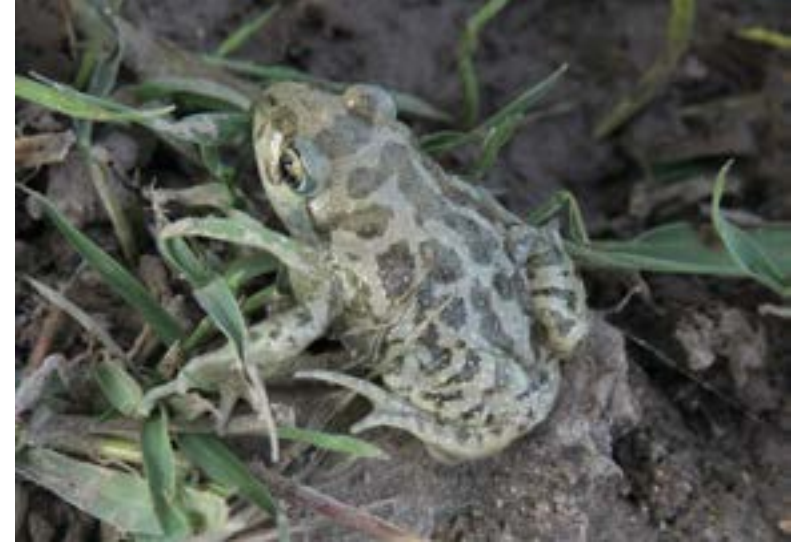
The Syrian spadefoot toad can be found only in the Jinsafut temporary rainfall pond near Wadi Qana: it is extinct in other places in Palestine and Jordan. To increase its population, the Palestine Institute for Biodiversity and Sustainability has raised tadpoles ex situ and successfully returned them to the Jinsafut pond.

with some significant success. Now is the time to enhance these trails and respond to those who are asking about how best to protect and preserve the environment while at the same time offering maximum benefit to people. Trail design must be based on scientific principles that respect the ecosystems (including nature and people) that they hope to serve. Bethlehem University's Palestine Institute for Biodiversity and Sustainability (PIBS) is devoting significant resources and expertise to address such issues. Let us take two case studies as examples that have great potential for ecotourism.