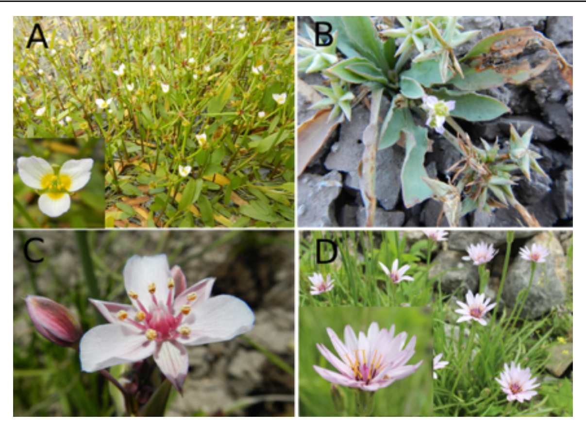
Figure 1 . A . Alisma plantago-aquatica L., B . Damasonium alisma Miller; C . Butomus umbellatus L; D . Scorzonera phaeopappa (Boiss.) Boiss.